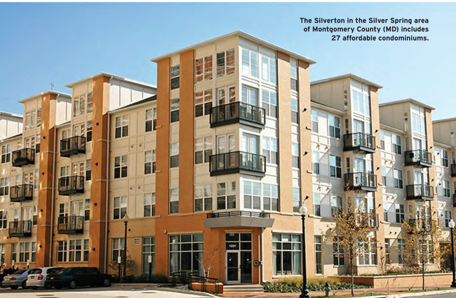
The Silverton in the Silver Spring area of Montgomery County (MD) includes 27 affordable condominiums.